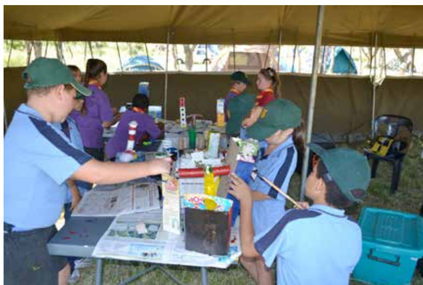
Ladysmith and Newcastle Cubs building their cities of the future.

Thanks to all the Scouters of NN and the committee of 1st Ladysmith for logistical support. The event will continue to be held every year, even if it doesn't rain!